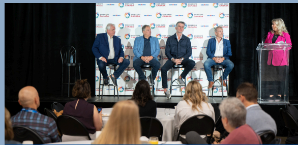
Panel Discussions with Industry Leaders