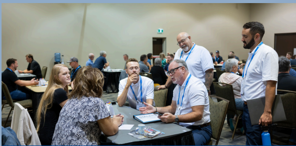
Curated Networking Events