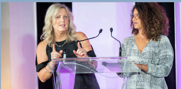
BOCSles Awards Gala