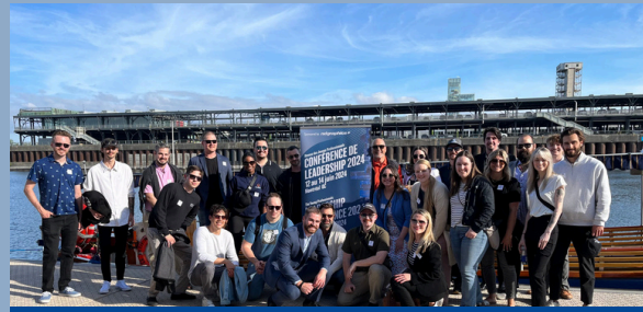
2025 YPN Conference