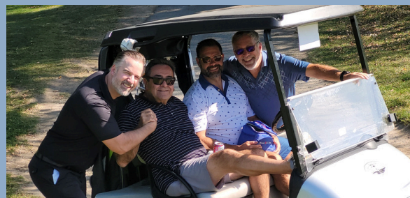
Don Morgan Memorial Golf Tournament